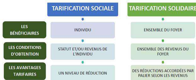
Figure 1. Tour de France GART-UTO, Optimizing the resources of the public transport 14

At the present time, there are over twenty-two cities that have deployed a solidarity pricing scheme (as opposed to free fares) which is directly linked to the household income as establishes a wide range of pricings available to families based on a set family quotient.